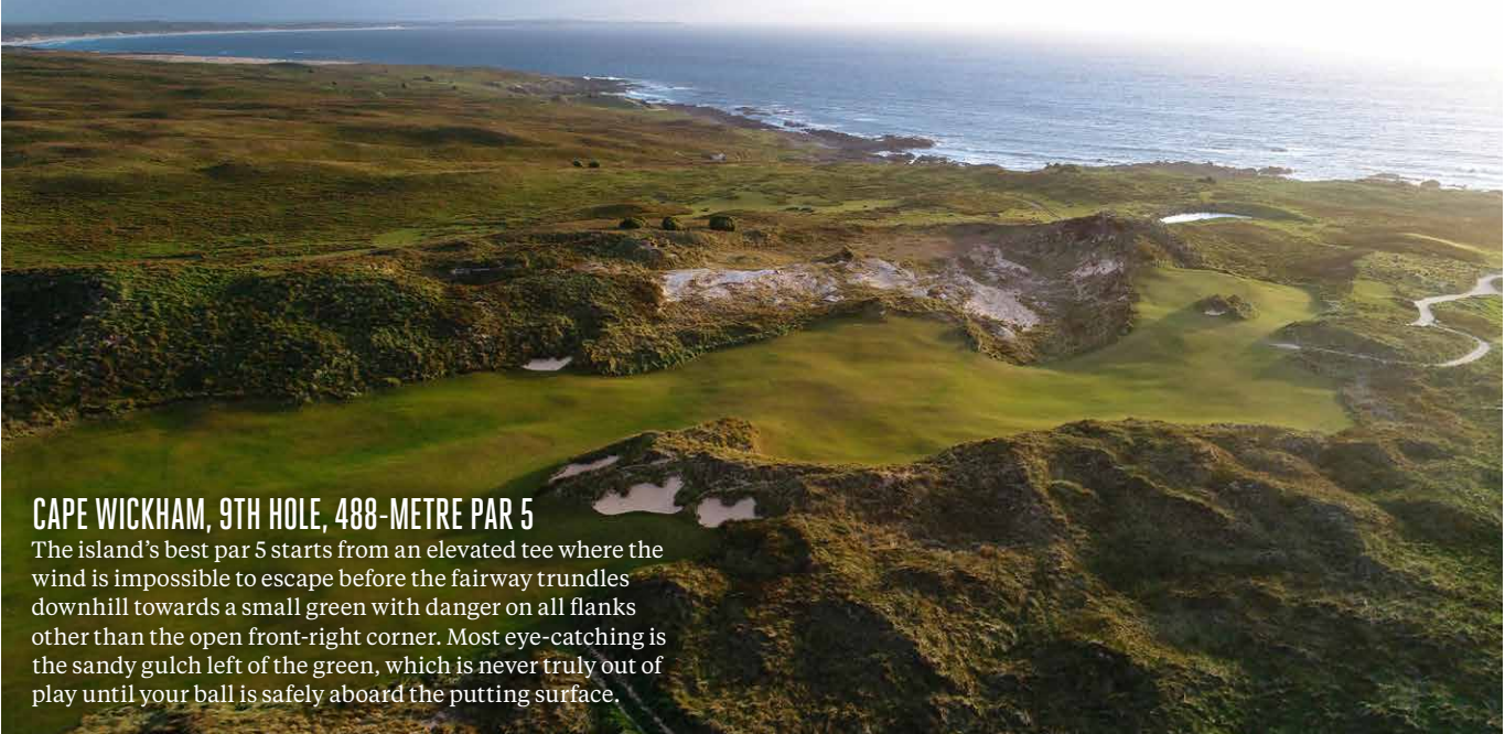
CAPE WICKHAM, 9TH HOLE, 488-METRE PAR 5 The island's best par 5 starts from an elevated tee where the wind is impossible to escape before the fairway trundles downhill towards a small green with danger on all flanks other than the open front-right corner. Most eye-catching is the sandy gulch left of the green, which is never truly out of play until your ball is safely aboard the putting surface.