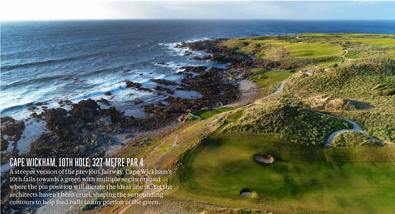
CAPE WICKHAM, 10TH HOLE, 327-METRE PAR 4 A steeper version of the previous fairway, Cape Wickham's 10th falls towards a green with multiple segments and where the pin position will dictate the ideal line in. Yet the architects haven't been cruel, shaping the surrounding contours to help feed balls to any portion of the green.